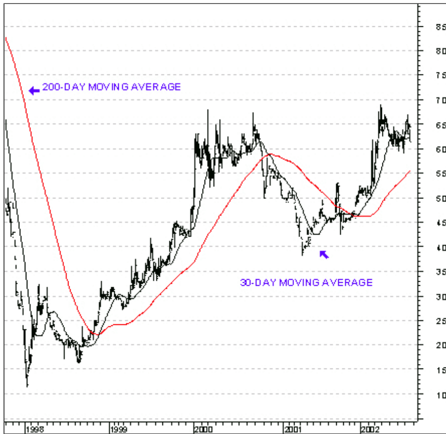
Moving Average Chart

The MACD just like the RSI can also be calculated on a weekly or monthly basis. In addition, a divergence between the share price or a market index and its MACD is a powerful indicator of a reversal. It is also useful for short - term traders and should be used in conjunction with other indicators.