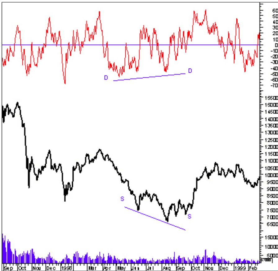
Demand Index Chart

Besides the above 3 technical indicators, there is a whole list of other technical indicators that a brief guide like this cannot cover. Stochastics, Demand Index, On - Balance Volume, Momentum, William's R, Advance Decline Line, etc are just examples of the many more that the ingenious human mind can think of. The bookshops have a wide range of books on such topics and subscribers are encouraged to buy some and work through them.